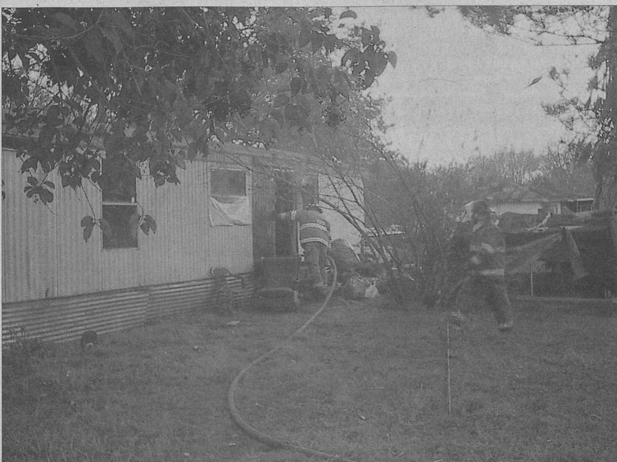
Eagle Lake Firefighters work to put out a blaze in a mobile home Wednesday, March 1, in the 500 Block of First St. One pumper truck was called out and about ten volunteers subdued the fire in a few minutes. The cause of the blaze is under investigation.

The accident was investigated by DPS Trooper Stephen Pierce.