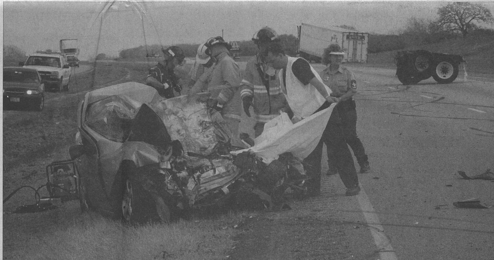
Law enforcement officers look over the wreckage of an automobile, which was westbound on Interstate 10 about five miles east of Weimar Tuesday afternoon when it veered out of control, and hit the rear of a tractor-trailer rig. The driver of the automobile was killed.